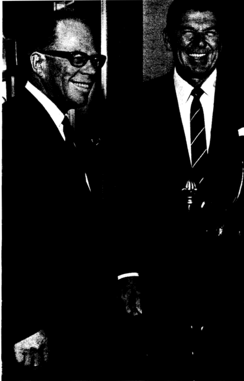
Gov. Reagan and U.S. Senator Thomas Kuchel