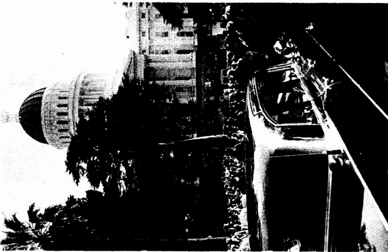
Governor Reagan's Closed Car Approaching the State Capitol for Inaugural Activities, January 5, 1967